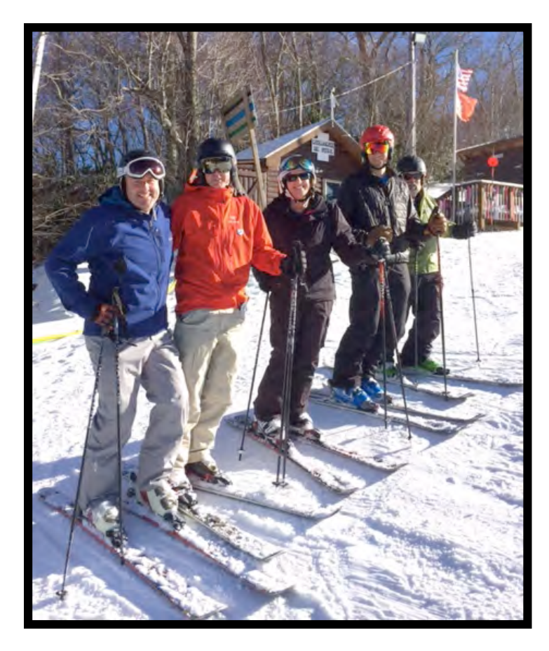
Photo below-PSI Southern Director Clinic at Timberline